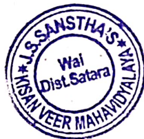
Principal, Kisan Veer Mahavidyalaya, Wai